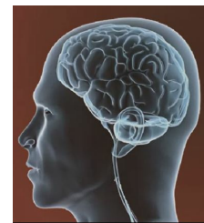
Anti-drug vaccine animation