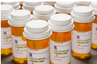
Anti-opioid vaccine could offer bridge to overcoming addiction